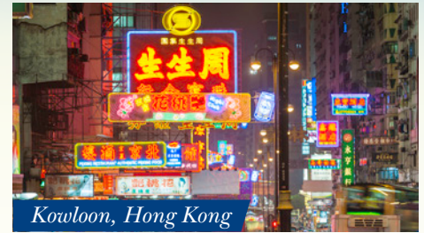
Kowloon, Hong Kong

Kowloon in Hong Kong is in the Hung Hom area situated close to the exit of The Cross Harbour tunnel from Hong Kong Island. The city has traditionally been home to blue- and white-collared