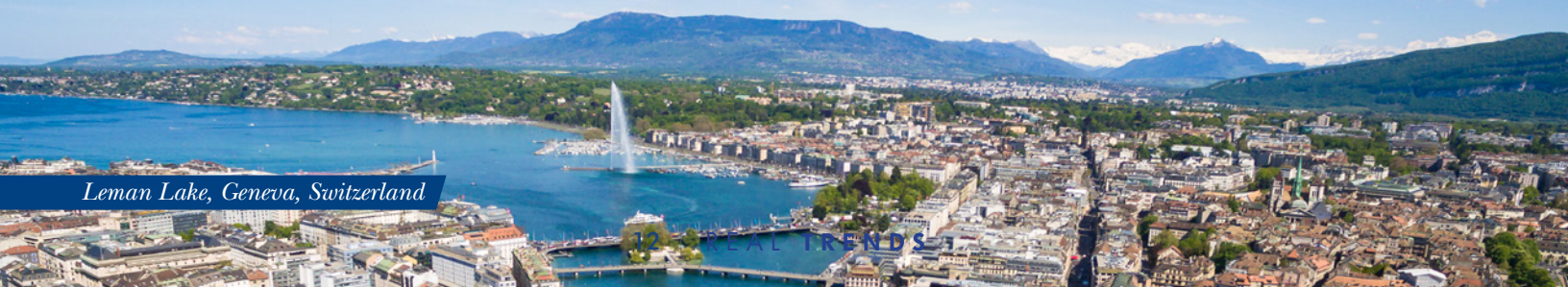
Leman Lake, Geneva, Switzerland

Lucca, Italy is a scenic, walled city in Tuscany. The historic center is comprised of cobbled streets, shaded piazzas, art galleries, restaurants and many churches